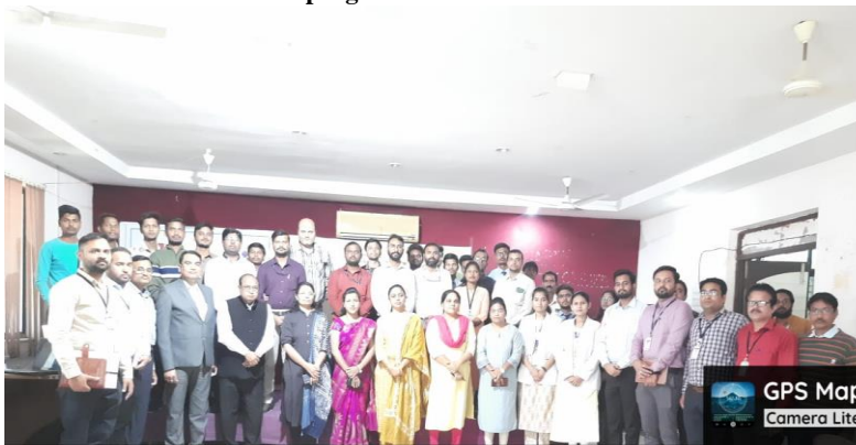
Participants during the program