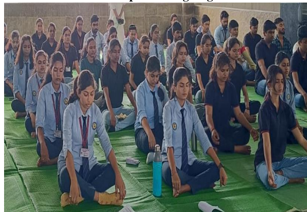
Students performing Yoga