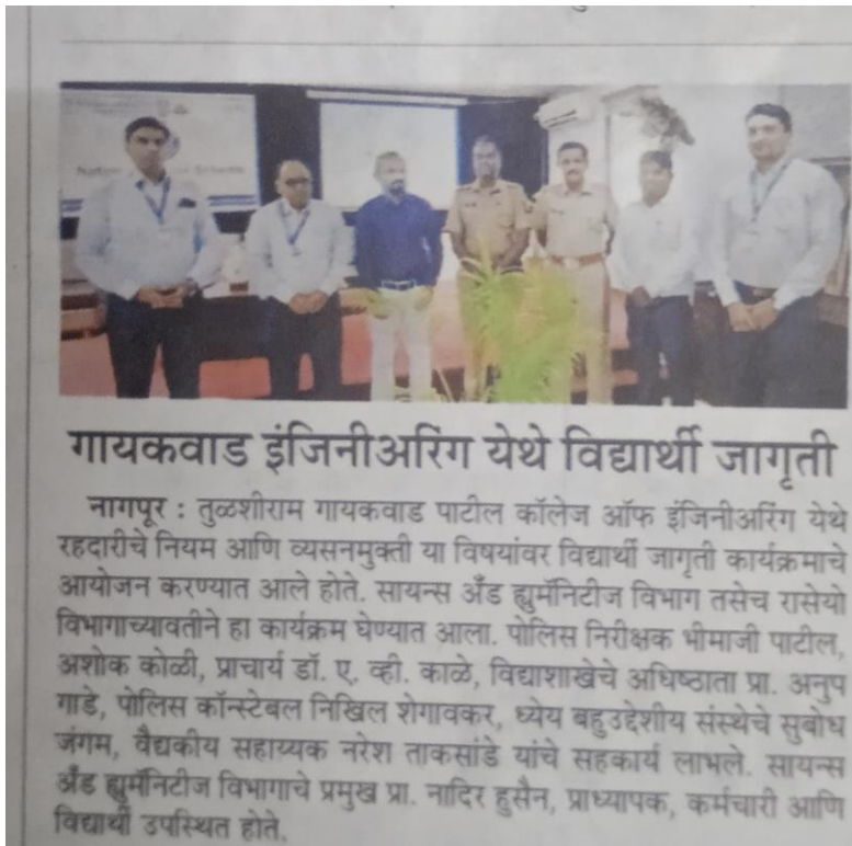
News article on Awareness programme on "Traffic rules and Anti-Addiction"