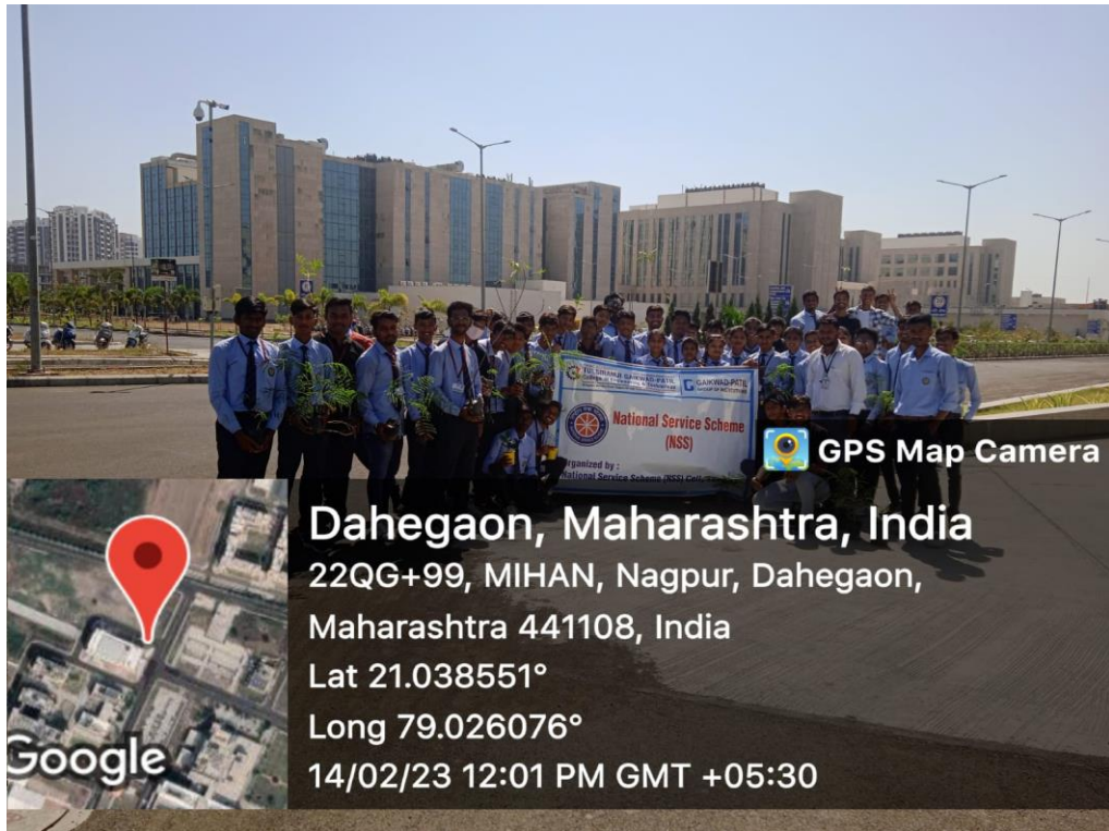
Students with trees after reaching AIIMS Nagpur