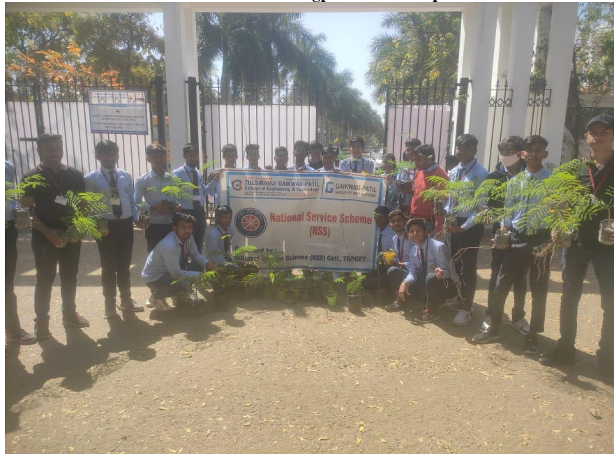
Students with trees before boarding the bus for AIIMS Nagpur