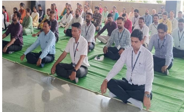
Staffs performing Yoga