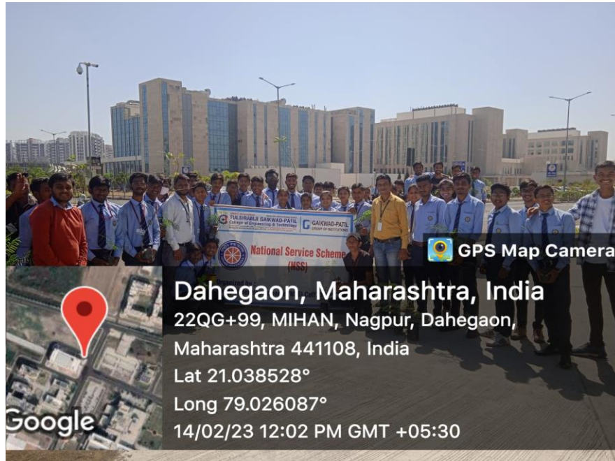
Photo Session at AIIMS Nagpur before tree plantation