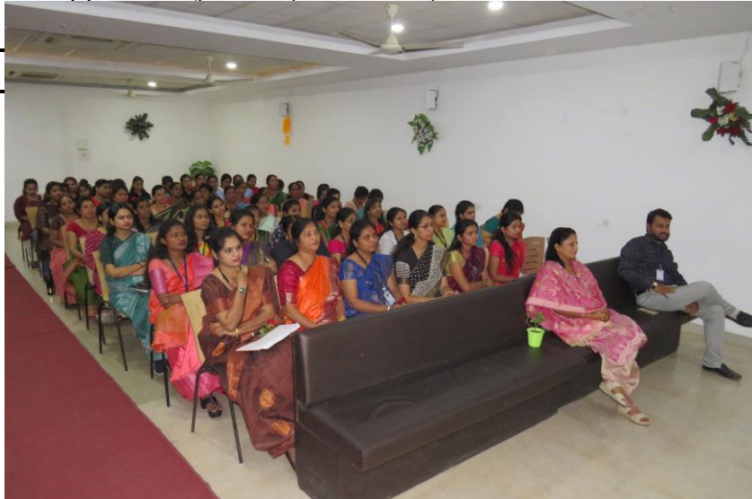
Audience during the program