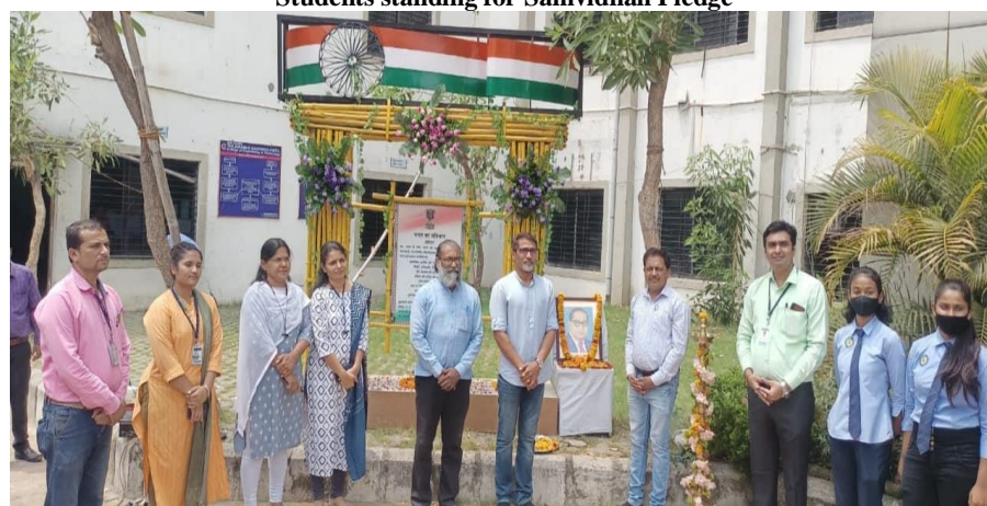
Students and staffs paying homage to Dr. B. R. Ambedkar