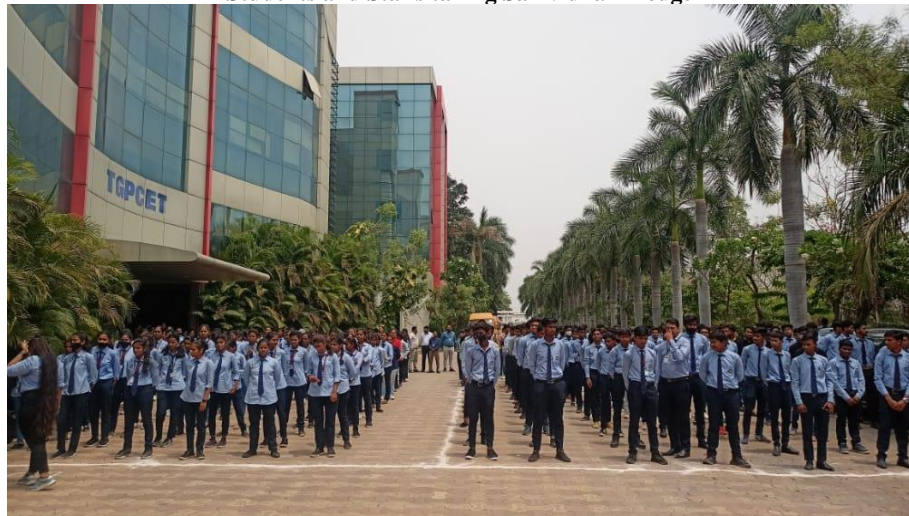
Students and Staffs taking Samvidhan Pledge