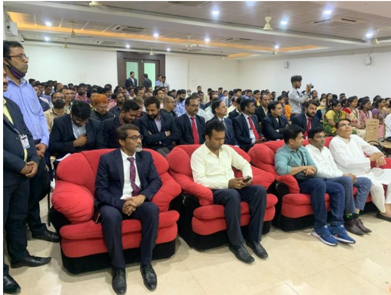
Audience during Program at JRD Tata Hall