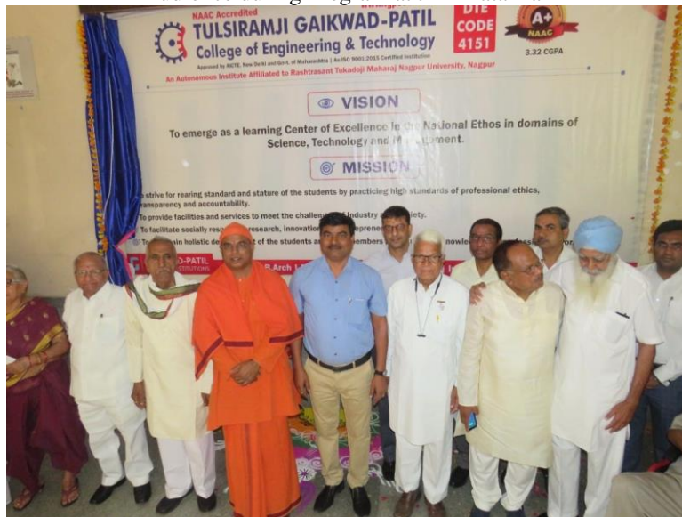
Unveiling of Vision and Mission of Institute