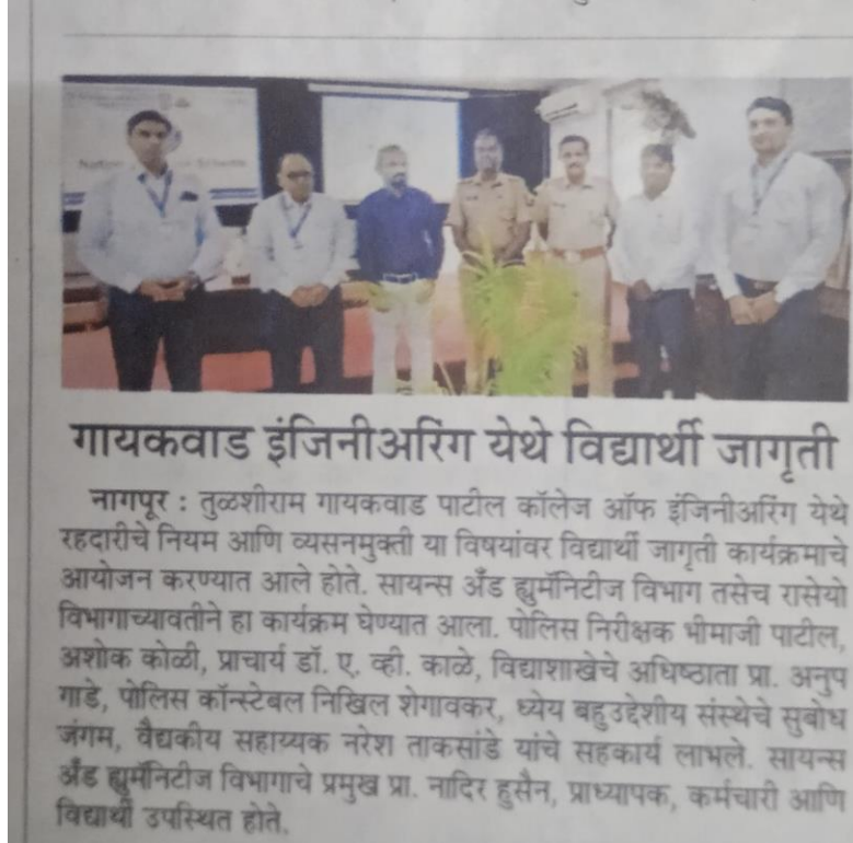
News article on Awareness programme on "Traffic rules and Anti-Addiction"