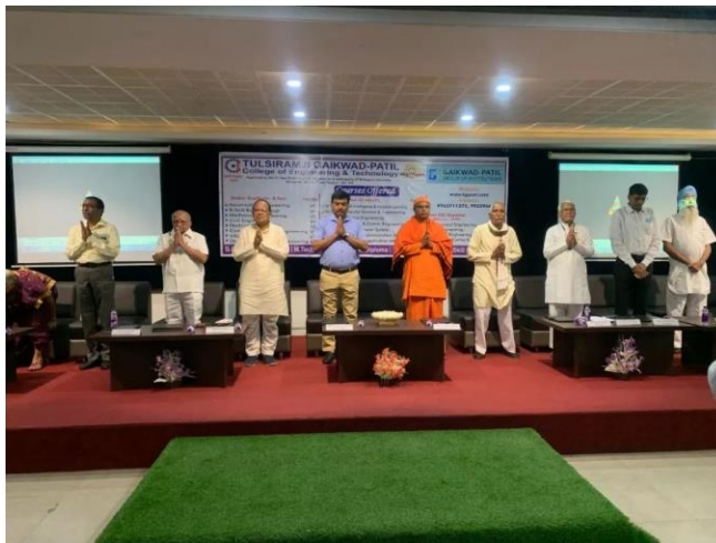
Program initiation with soulful prayer "Itni Shakti Hame Dena Data"