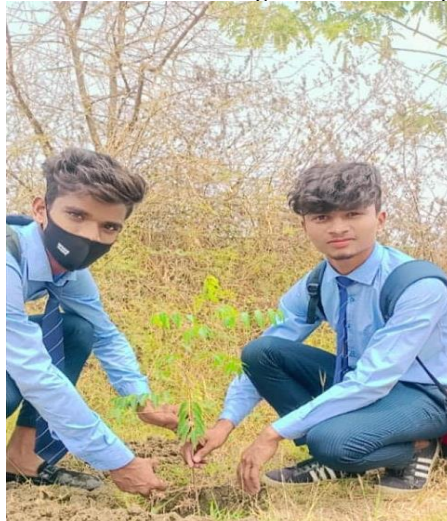
Tree Plantation of the occasion of Samvidhan Diwas