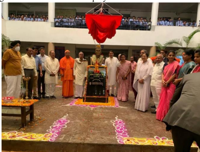
Unveiling of Late Shri Tulsiramji Gaikwad Patilji Statue