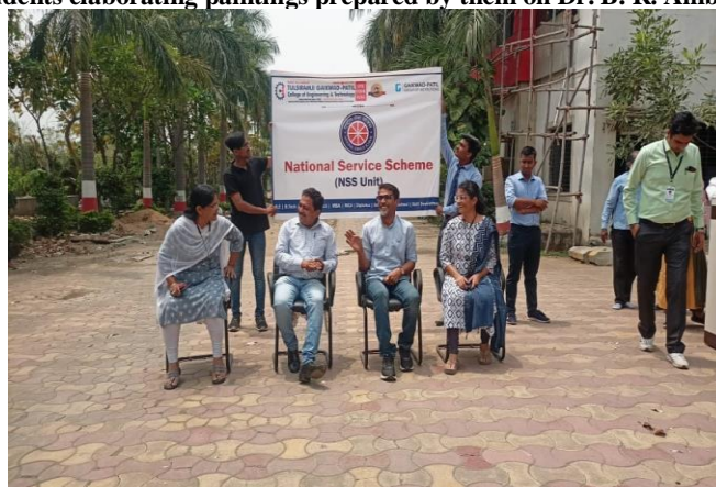
Photo Session during program