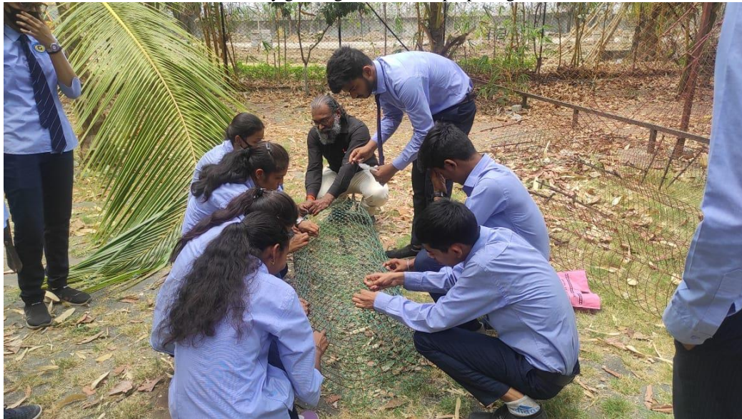
Tree Guards getting ready for installation

Principal Tulsiramji Gaikwad Patil College Of Engineering and Technology, Nagpur