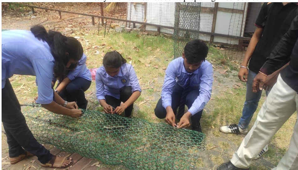
1st Year students preparing Tree Guards