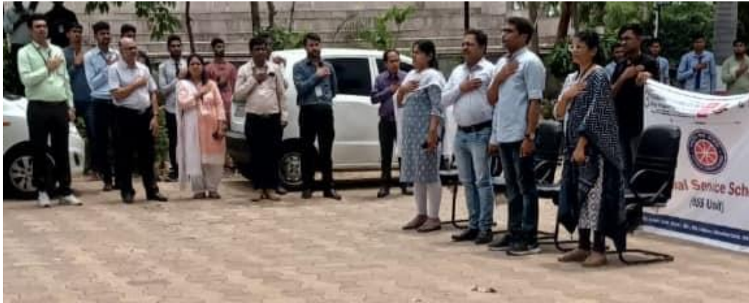
Students and Staffs taking Samvidhan Pledge