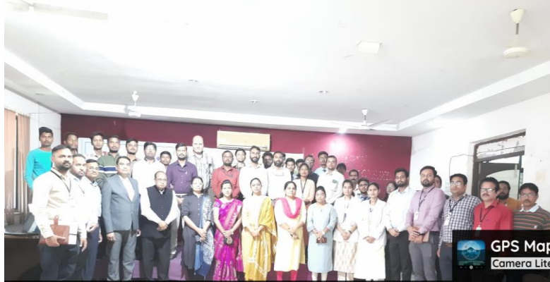
Participants during the program