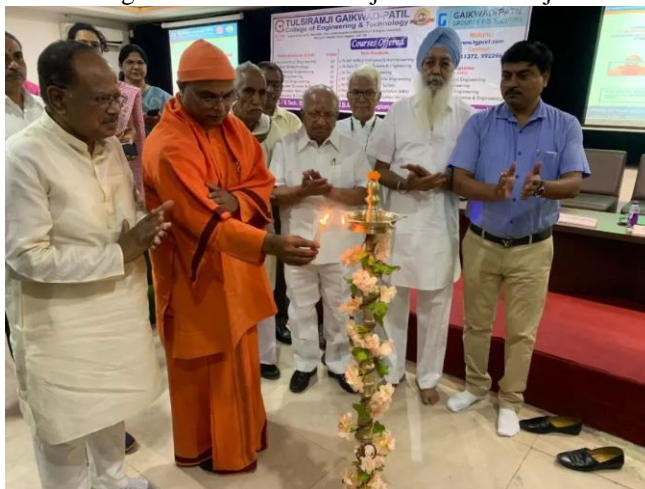
Lamp Lightening with the hands of Guests