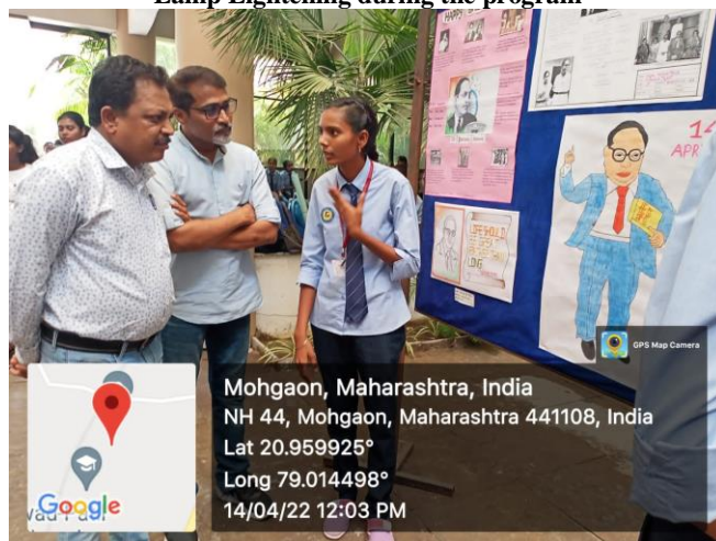
Lamp Lightening during the program

Mohgaon, Maharashtra, India NH 44, Mohgaon, Maharashtra 441108, India Lat 20.959695° Long 79.014647° 14/04/22 11:38 AM