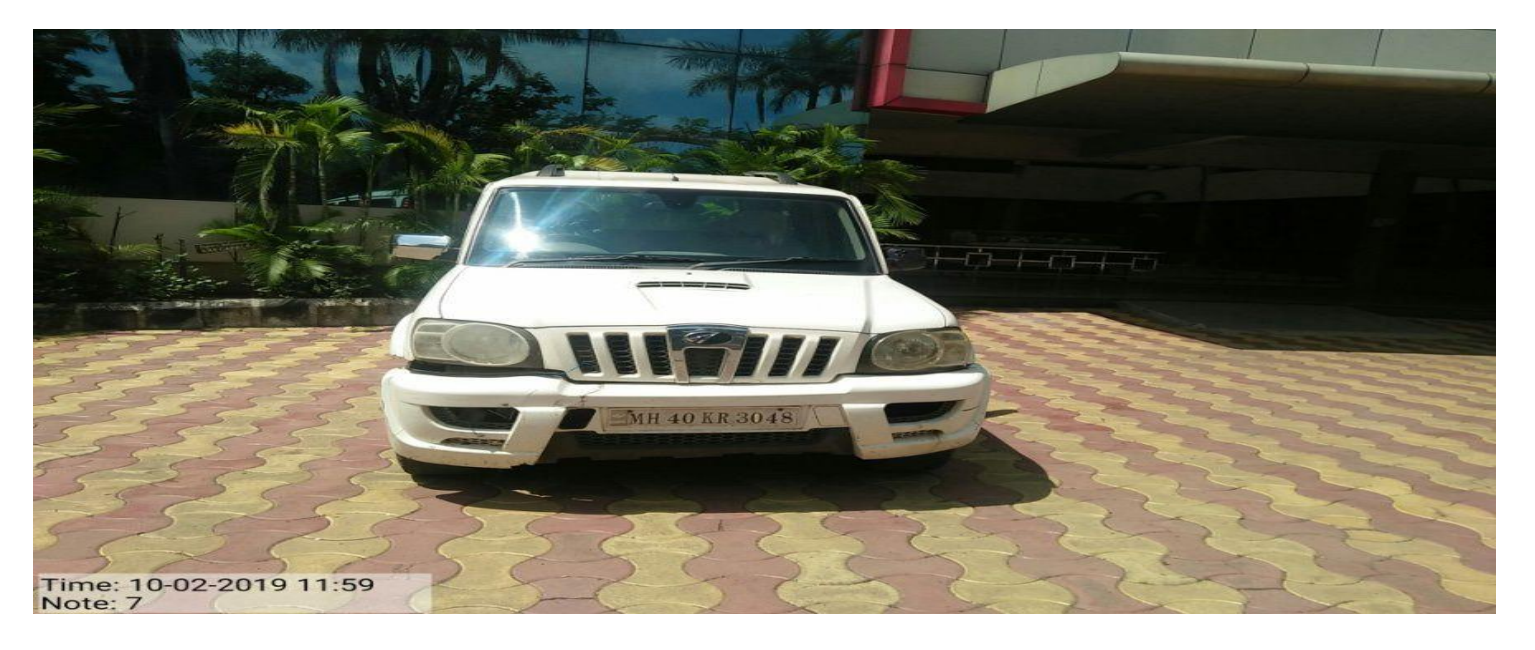
Vehicle for Medical Emergency

Tulsiramji Gaikwad Patil College Of Engineering and Technology, Nagpur