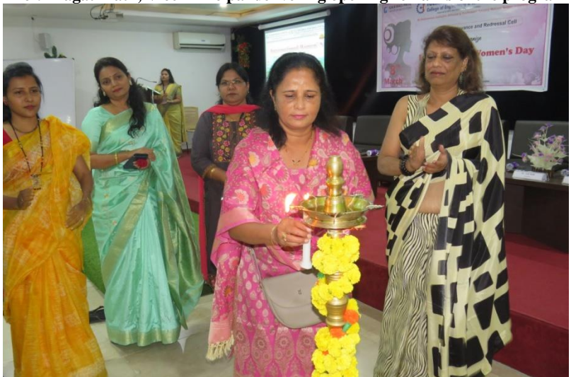
Lamp Lightening with the hands of Guests of the program