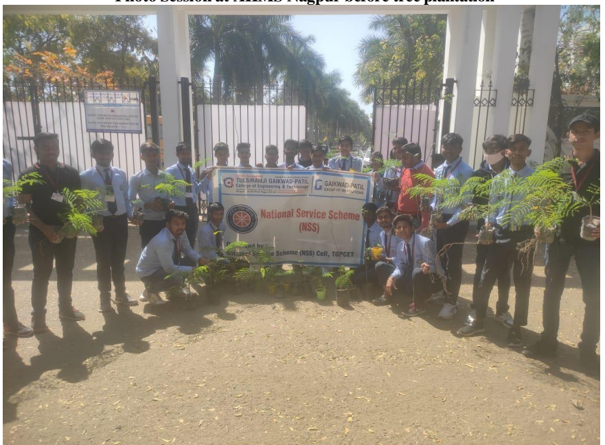
Students with trees before boarding the bus for AIIMS Nagpur