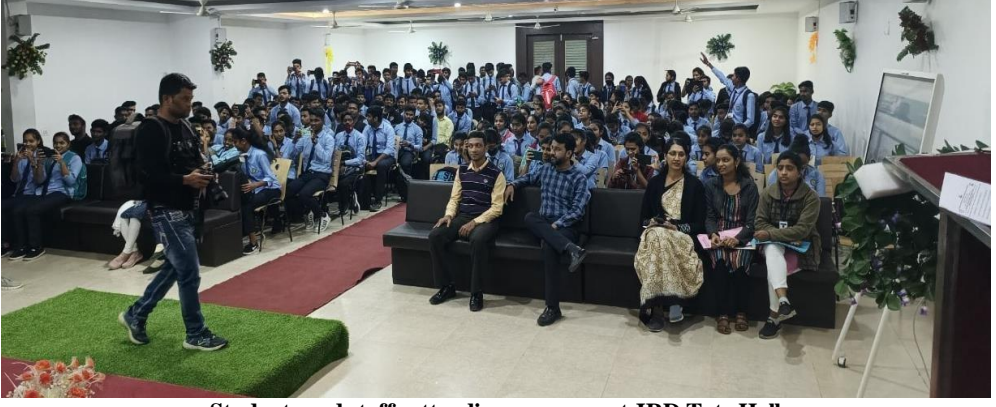
Students and staffs attending program at JRD Tata Hall