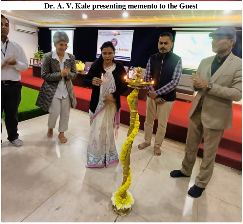
Lamp Lightening during the program