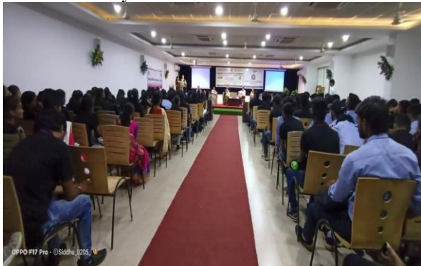
Program at JRD Tata Hall