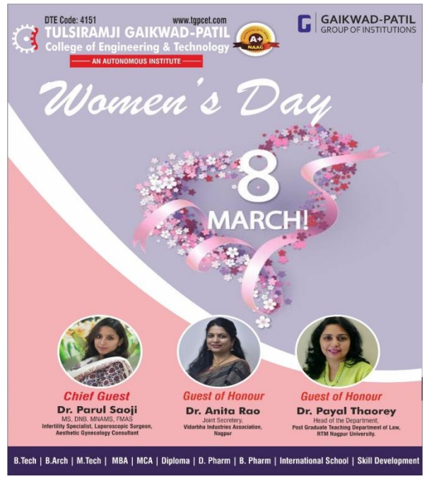
Flyer of the Program